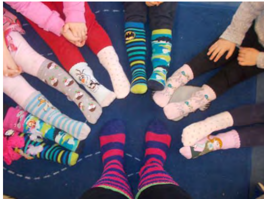
Downs Syndrome Silly Sock Day